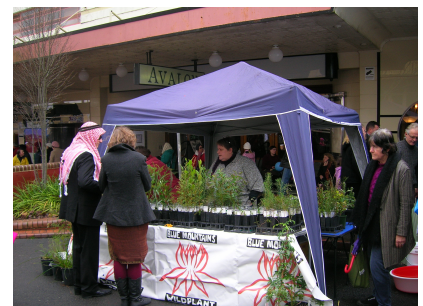
Winter Magic Stall. 20 June, 2009

Wildplant will have a stall at Blackheath Primary School on the 1 st Sunday of the Month.